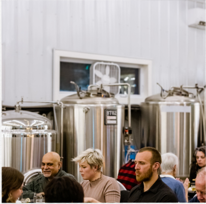
Tour & Tasting